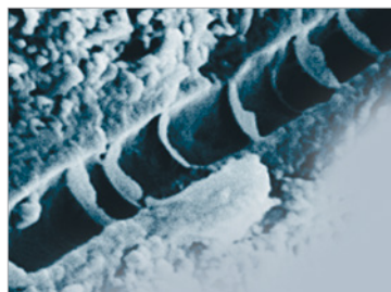
Protein septas following application of GLUMA