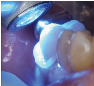
3-second tack cure