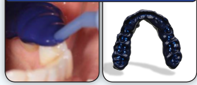
Apply. Check occlusal contact.