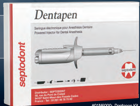
#01N6000: Dentapen Kit

All accessories are available separately. Finger grips and cartridge holders must be sterilized before use.