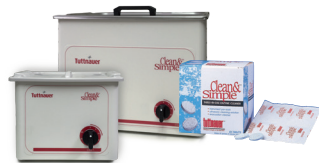
Clean&Simple™ Ultrasonic Cleaners and Tablets

Documents: date, time, temperature, pressure.