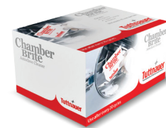
Chamber Brite Autoclave Cleaner