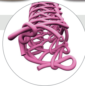
Aluminum Chloride (AlCl 3 ) 0.5 + 0.1mg/inch