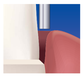
2 Position tip parallel to axial plane of the tooth.