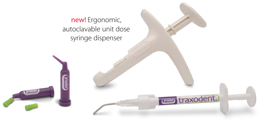
Sleek syringe with bendable tips