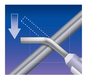
1 Bend tip for optimal access.