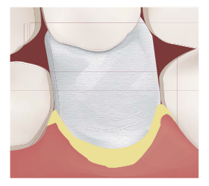
5 Have the patient bite and maintain pressure on the cap. Wait 2 minutes.