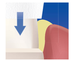
4 Place Premier® Retraction Cap on tooth structure.